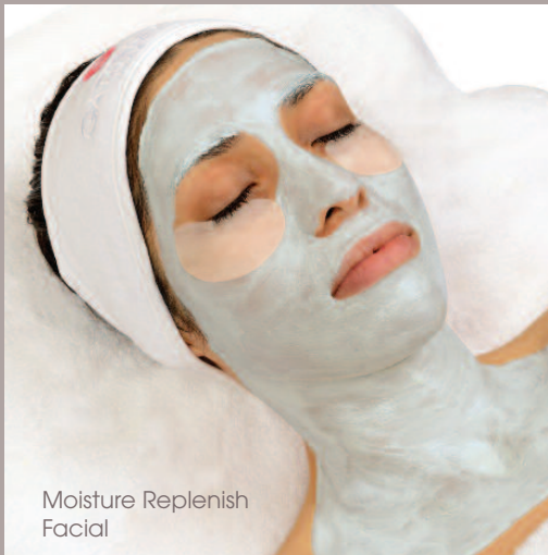
Moisture Replenish Facial