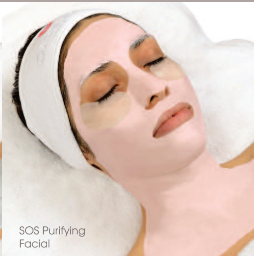
SOS Purifying Facial