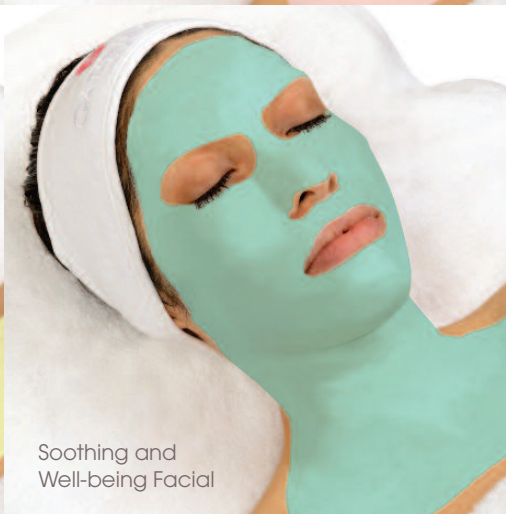
Soothing and Well-being Facial